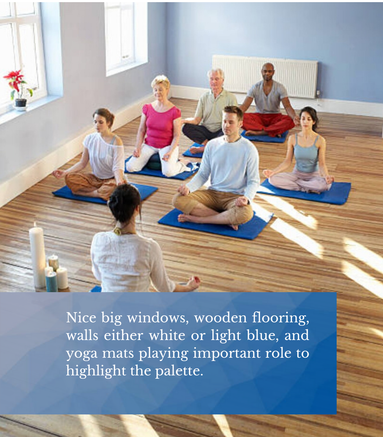
Nice big windows, wooden flooring, walls either white or light blue, and yoga mats playing important role to highlight the palette.